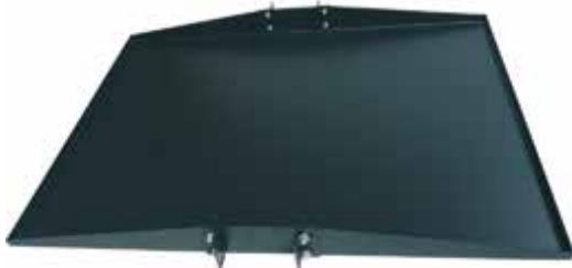
Double Sided Shelves