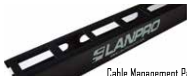
Cable Management Panels