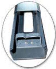
Simplex Vertical Cable Manager