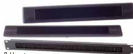
Cable entry covers