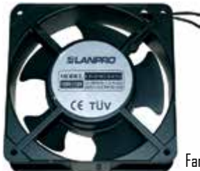
Fan Spares 7000 Series