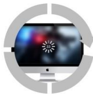
Conventional Megabit LAN Port