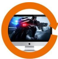
G103 Gigabit Wired LAN Port

Downstream rate up to 2.5Gbps which is 100 times faster than conventional 24Mbps ADSL brings freewheeling internet access.